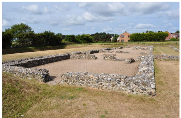
Remains of a historic Roman fort