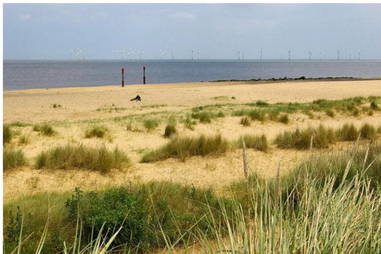
Miles of natural sandy beaches