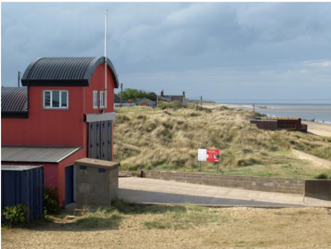
Englands first independant lifeboat station one of only two in the country

Three Bedroomed House refurbished 2011. Situated in a quiet residential area on the outskirts of Caister on Sea. Non smoking premises