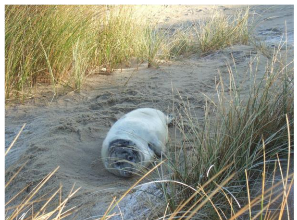
Seals on Horsey Beach